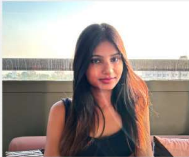
TANISHA SONI MEDIA