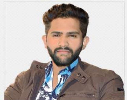
ADARSH CHOUKSEY GRAPHICS & DESIGNING