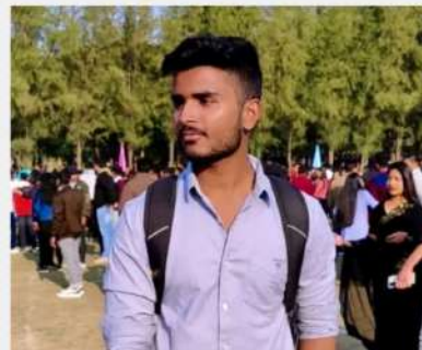
ANUJ KHATRI MEDIA