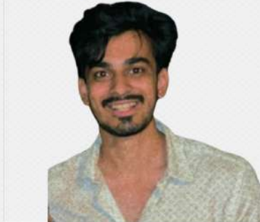
ADEESH KOSHAL GRAPHICS & DESIGNING