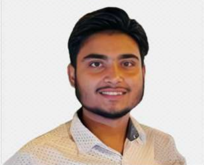
UDIT SHRIVASTAV GRAPHICS & DESIGNING