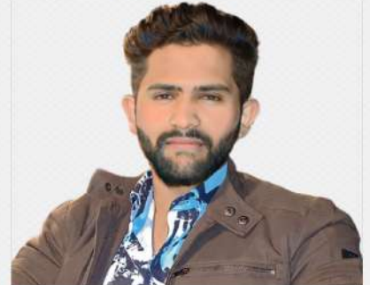
ADARSH CHOUKSEY GRAPHICS & DESIGNING