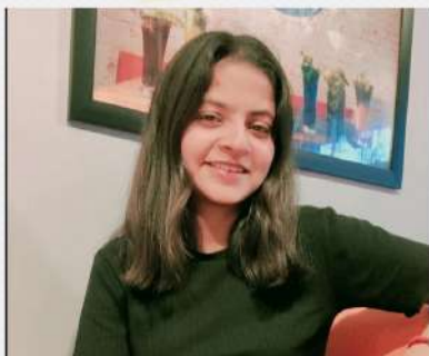
PRATHA PANDEY MEDIA