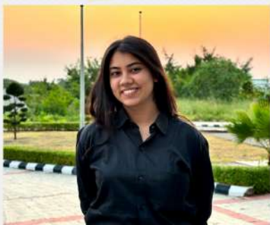
NUTAN MANWANI GRAPHICS & DESIGNING