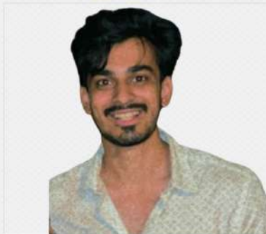
ADEESH KOSHAL GRAPHICS & DESIGNING